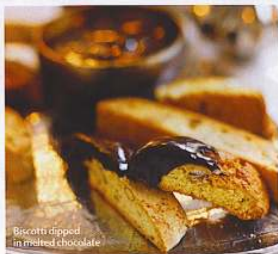
Biscotti dipped in melted chocolate